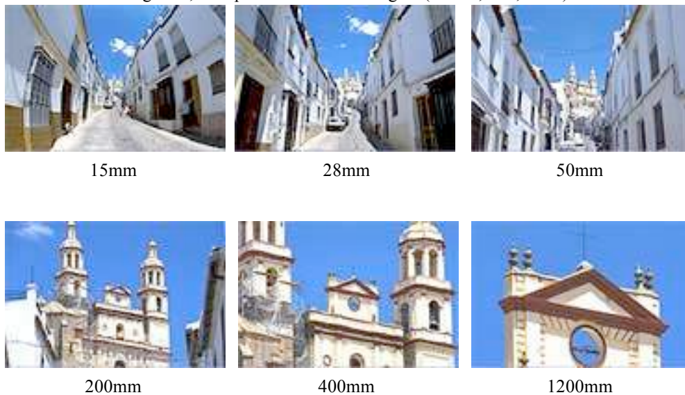
Figure 2, Comparison of Focal Lengths (Canon, Inc., 2004)

Telephoto lenses. Getting close to the action may not be practical. Telephoto lenses allow a photographer to capture an image from a distance. Refer to figure 2 for a comparison of focal lengths.